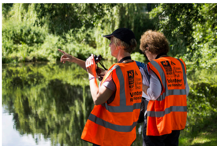
Essex Wildlife Trust.

Branch Out encompasses projects ranging from a landscape scale with many partners to smaller community and farm based projects.