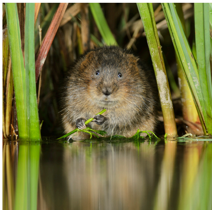
Whittaker, Terry. 2020 Vision.

Suffolk Wildlife Trust is leading on a project to create a rich landscape of wetland habitat from Lowestoft to Beccles. Essex & Suffolk Water has been able to help support this work through Branch Out. Other key partners are the Broads Authority, Environment Agency, Natural England and local landowners. Reconnecting, expanding and buffering wildlife rich sites will make them less vulnerable to water level changes and will benefit the unique Broadland species associated with the dykes and wet marshes. www.suffolkwildlifetrust.org .