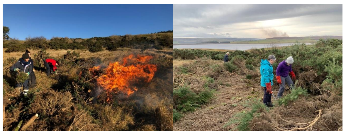
DWT Heart of Durham Volunteers removing and burning gorse at Cronkely Bank