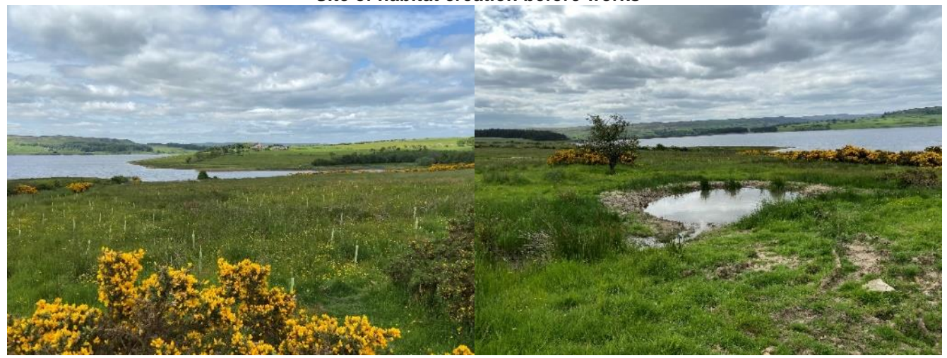
Site of habitat creation following creation of new pond/ wetland areas and tree planting (June 2021)