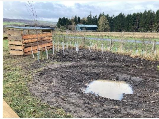
Bug Hotel rear view, showing scrape pond, hedge planting and area prepared to receive wildflower seeds