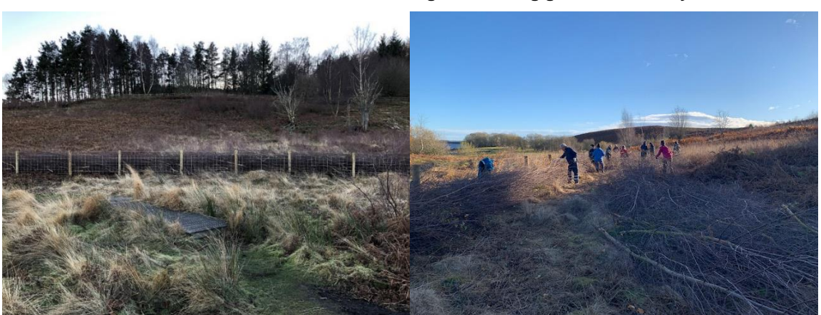
New fencing at Powhill and deadhedging using birch removed from heathland