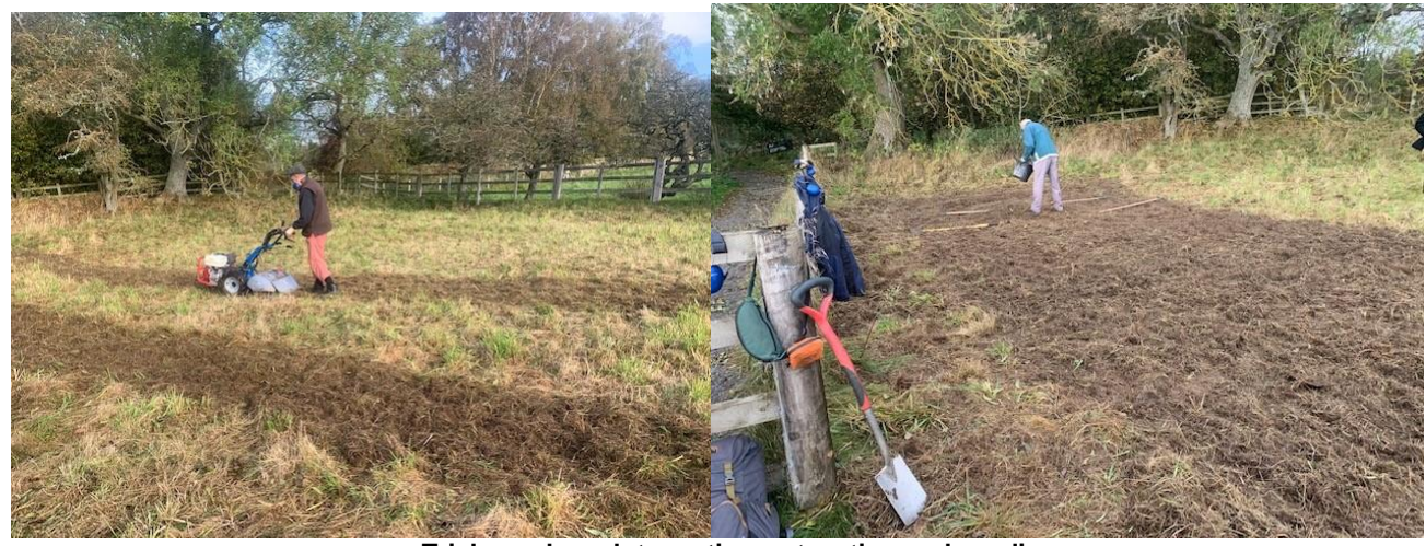
Trial meadow plot creation- rotavating and seeding