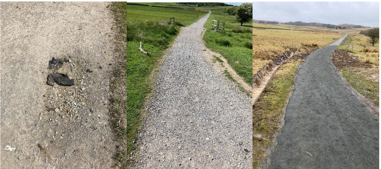
Path works before improvements: (Left) Typical pothole in footpath, showing wear beneath the membrane. (Right) Hump and incorrectly placed drain crossing the footpath