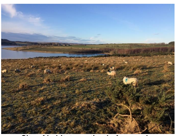
Site of habitat creation before works