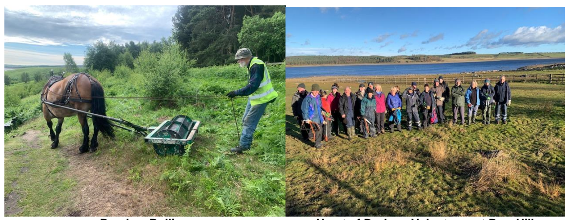
Bracken Rolling Heart of