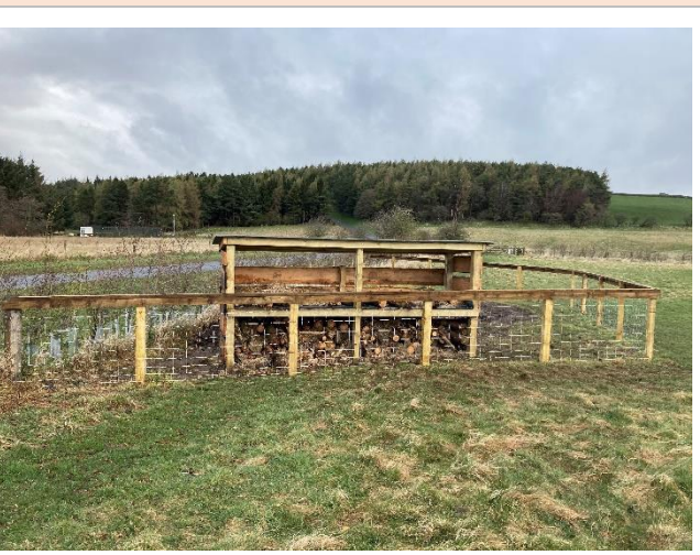
Bug hotel, showing half-filled hotel and fencing