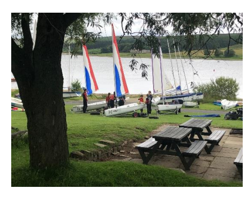
See p. 4-8