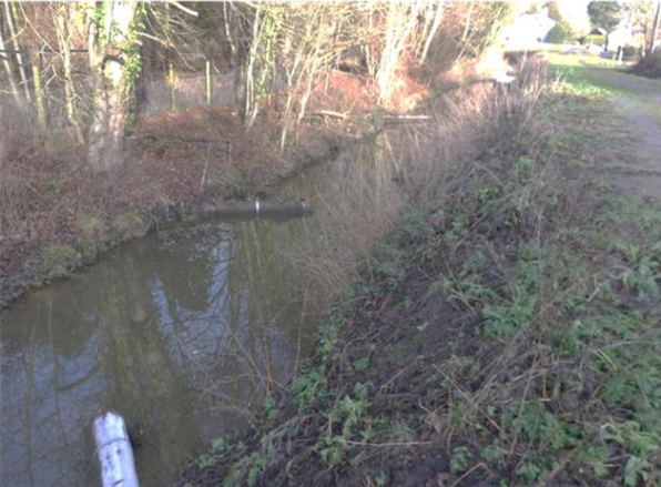
Opening of the channel to improve light and the installation of log jams, silt traps and deflectors