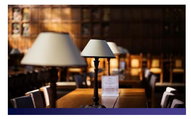
"A good cost assessment should lead to an accurate estimate of the efficient cost level..."

The regulator ultimately uses this information to set a cost allowance , which includes an efficiency target based on the difference between a company's actual cost level and the estimated efficient cost level.