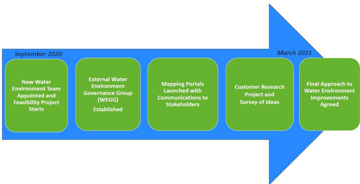
Figure 1: High Level Timeline for Water Environment Improvements Project

This new approach was accepted by Ofwat, our economic regulator, as part of our 5-year business plan for 2020. Improvements will be delivered over 5 financial years from April 2020 to March 2025. The Water Environment Team at NWG will work with partners, stakeholders and customers to develop the approach by March 2021, which will then be implemented.