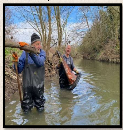
Local volunteers clearing rubbish from the River Roding.