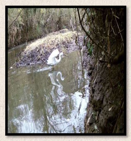
Little egret captured on camera trails installed on areas of improvement